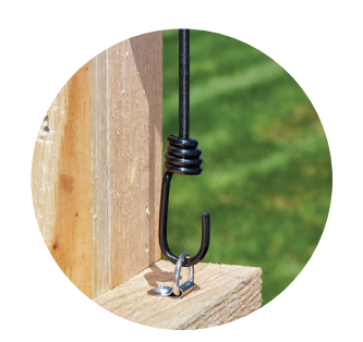
Bungee cord system