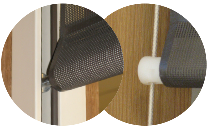
Choice of track (left) or cable (right) guide system