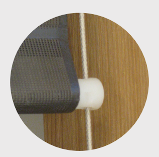
Cable guide system