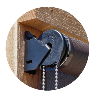
Clutch and heavy duty bracket