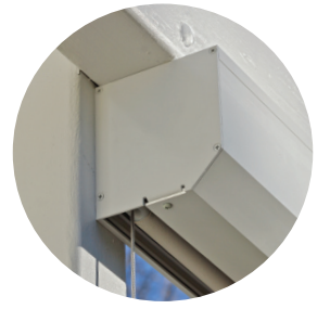
5" x 5½" extruded aluminum head box